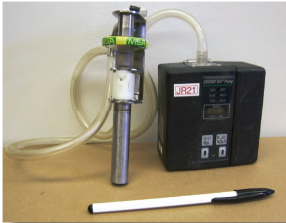
a. Coal Mine Dust Personal Sampler Unit