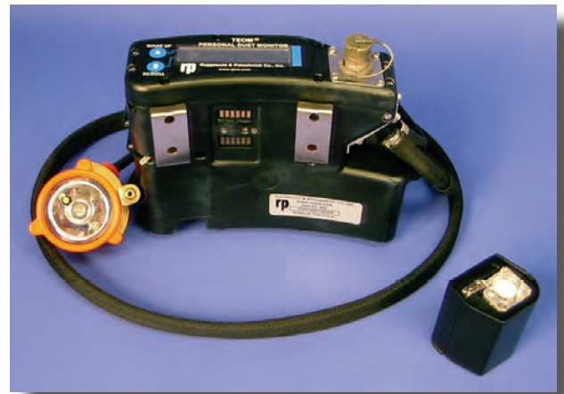
b. Continuous Personal Dust Monitor